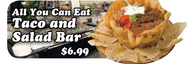
All You Can Eat Taco and Salad Bar $6.99