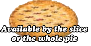
Available by the slice or the whole pie